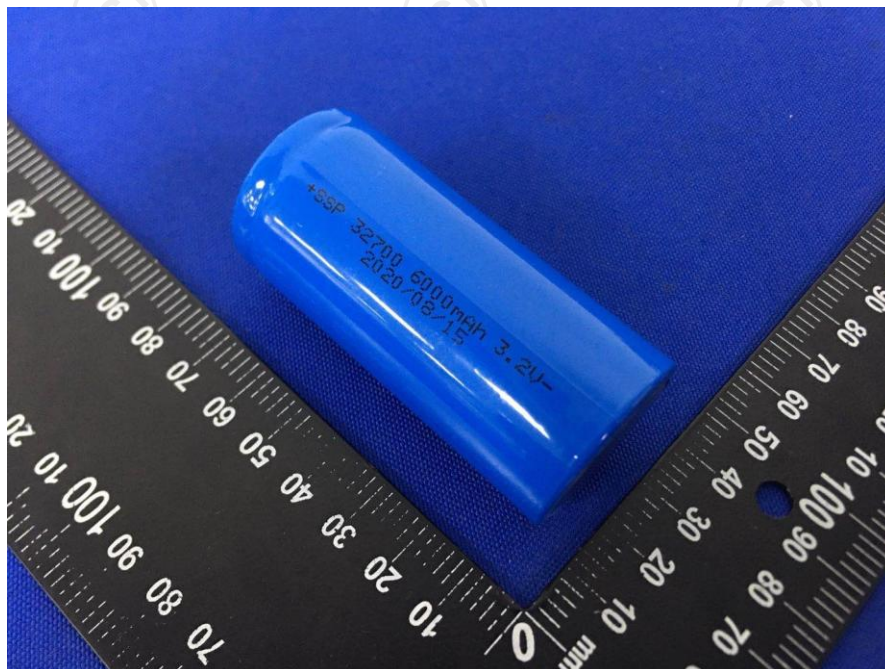
Picture 1. Cell view